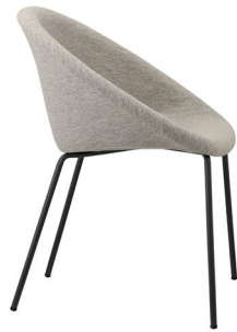
2685 VA T6 28

Poltrona con scocca imbottita e anima in tecnopolimero. Struttura a 4 gambe in acciaio tubolare ø mm 16 verniciato antracite. Giulia Pop è adatta a tutti gli ambienti dalla casa al contract. Rivestimento in tessuto non sfoderabile. Per uso interno.