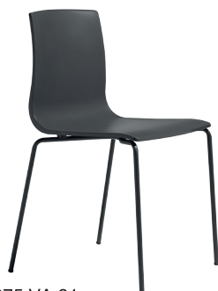
2675 VA 81

Scocca in tecnopolimero riciclabile. Struttura a 4 gambe in tubo d'acciaio ø mm 16 zincato e verniciato per uso interno ed esterno. Impilabile.