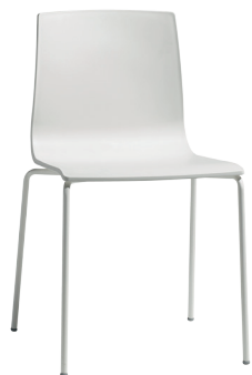
2675 VL 11