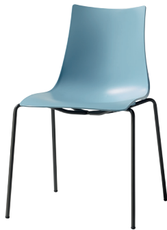
2615 VA 62

Scocca in tecnopolimero riciclabile. Struttura a 4 gambe in tubo d'acciaio ø mm 16 zincato e verniciato per uso interno ed esterno. Impilabile.