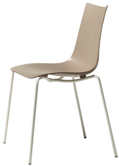
2615 VL 15